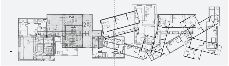
fig. 2 Trung Mai. Architectural plan of the exhibition with an overlay of standard layouts of Soviet and Vietnamese apartments