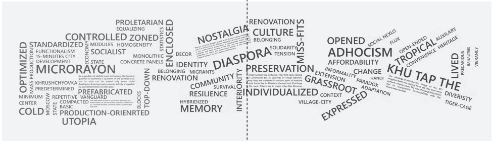
fig. 3 Trung Mai. Architectural diagram with an overlay of key concepts and terms for each of the three parts of the exhibition. Author's version